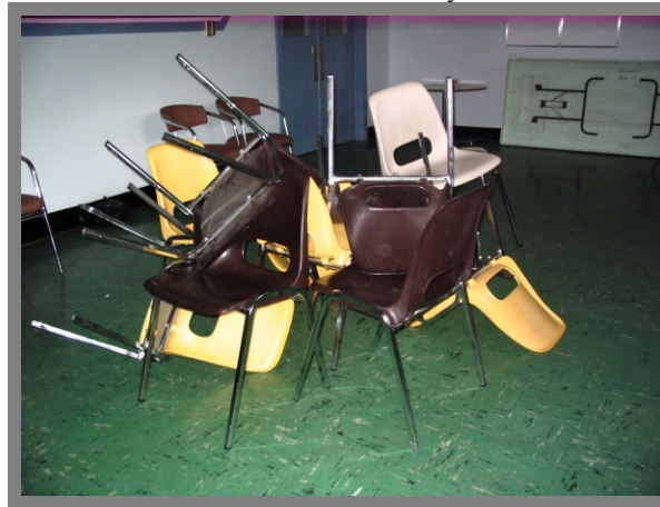
Figure 2 The Chair Activity

In TO workshops, short scenarios are developed to reflect the underlying stories of the group’s everyday lived experience (Boal 2002). The scenarios contain an unresolved climax that seeks a resolution in a second stage of the TO process: a forum in which the dramatic action is driven by the audience. As ‘spect-actors’, forum audiences propose and enact courses of action, while the ‘actors’ face the newly created situations and respond to the possibilities they present, allowing the whole group to consider what is, but also what might be and what can be. In the critical, reflective dialogue that follows an intervention by an audience member, ideas for other potential courses of action emerge and the cycle begins again. The shared understandings developed by witnessing through the interactions are used by the group to interpret and create meanings from subsequent interactions.